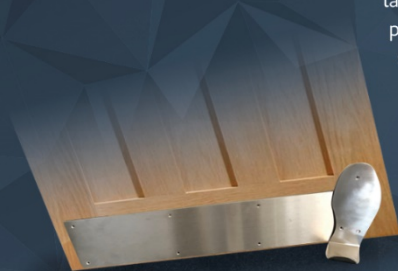
Kick-plates and Footprints for hygienic door opening

Additionally, we're also able to create bespoke engineering solutions to provide peace of mind to any industry, large or small, to help you welcome your customers back again. Call us today, find out how we can help.