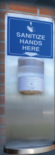
Hand Sanitising Stations Free-standing or wall-mounted